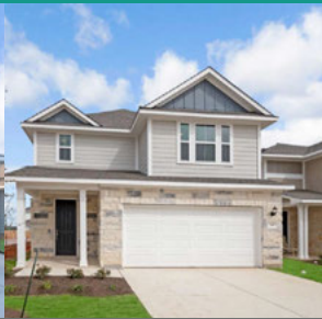
HYMEADOW HAYS COUNTY