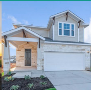
CLEAR CREEK ROUND ROCK