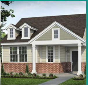
CASSETTA RANCH KYLE

List price is the for sale price. No auction and no bidding.