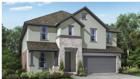
BLACKHAWK from the $260s in Pflugerville