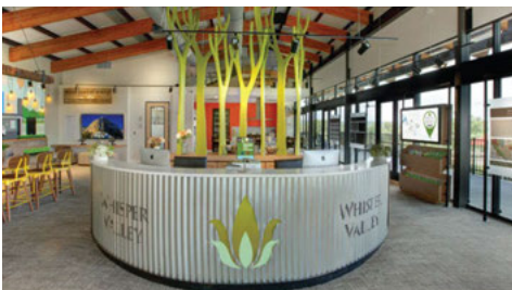
WHISPER VALLEY Opening May 2019 in East/Central Austin