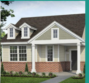
CASETTA RANCH KYLE

List price is the for sale price. No auction and no bidding.