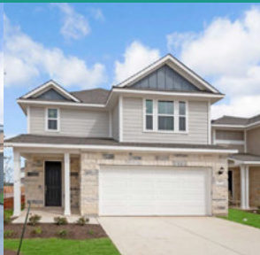
HYMEADOW HAYS COUNTY