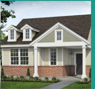
CASSETTA RANCH KYLE

List price is the for sale price. No auction and no bidding.