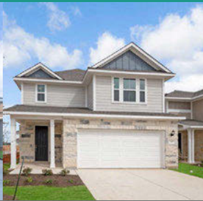
HYMEADOW HAYS COUNTY