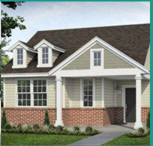
CASSETTA RANCH KYLE

List price is the for sale price. No auction and no bidding.